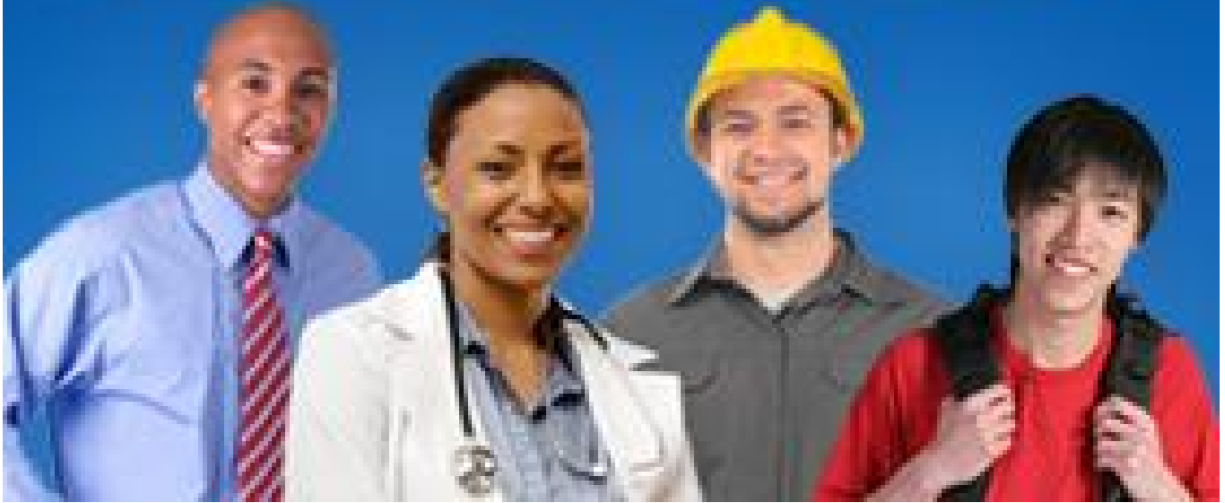
Come to Canada