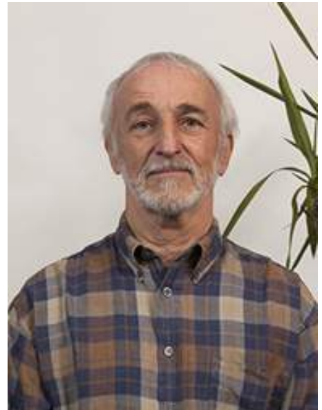
Object in background