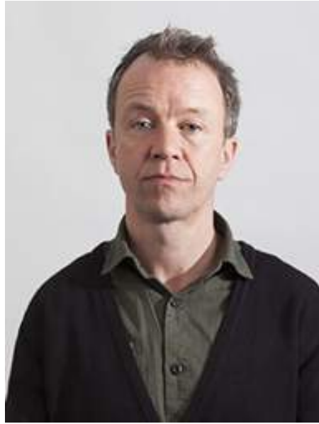
Shadow on face