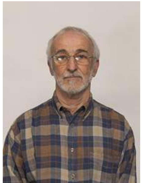
No glare on glasses