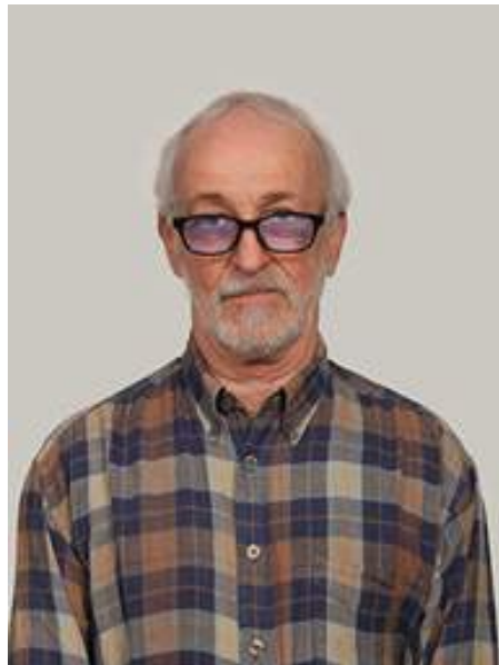
Don't cover eyes with glasses