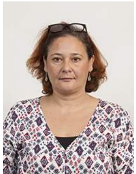
No hair accessories