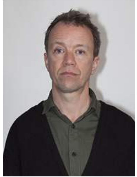
Shadow behind head