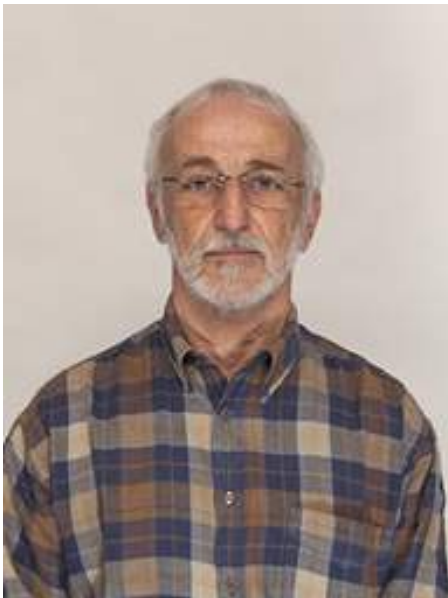
Eyes fully visible