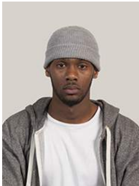
No fashion headwear