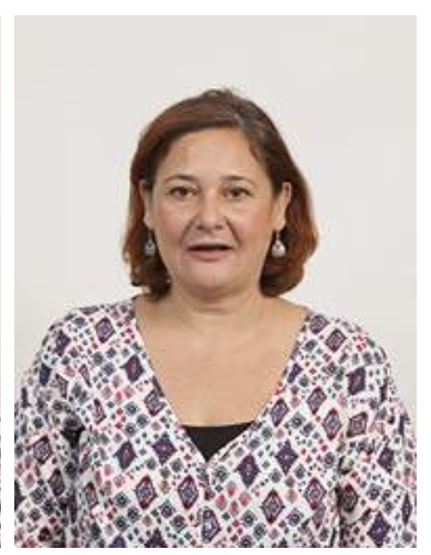
Plain expression Don't smile Keep your mouth closed