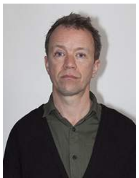
Approved Shadow on face Shadow behind head